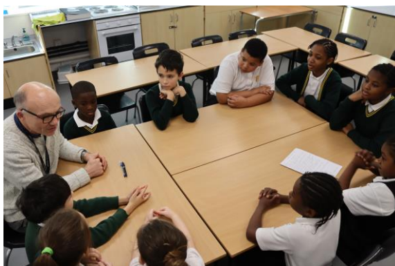
The children had their first council meeting of the year.